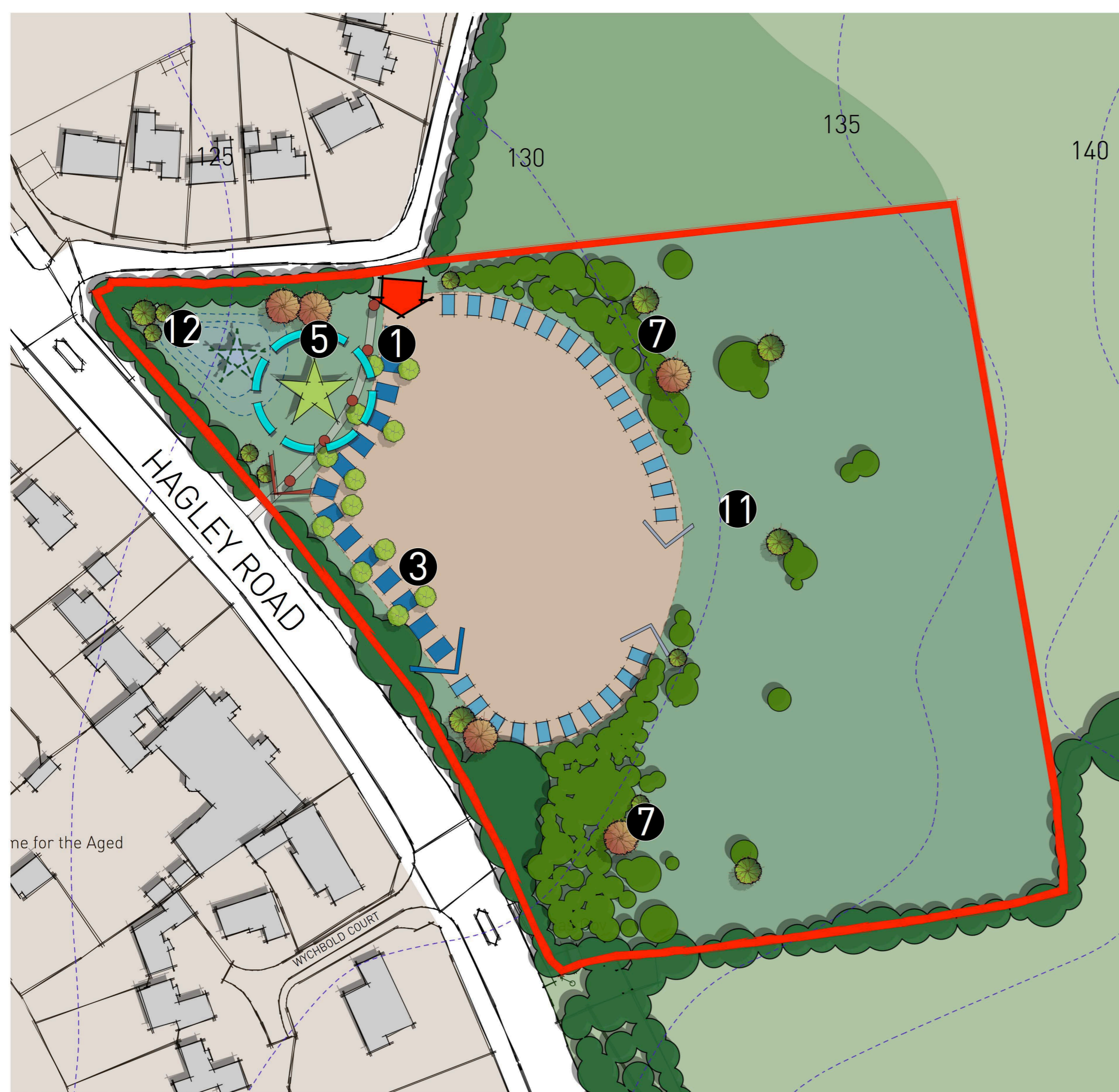
SITE B - 1/1000