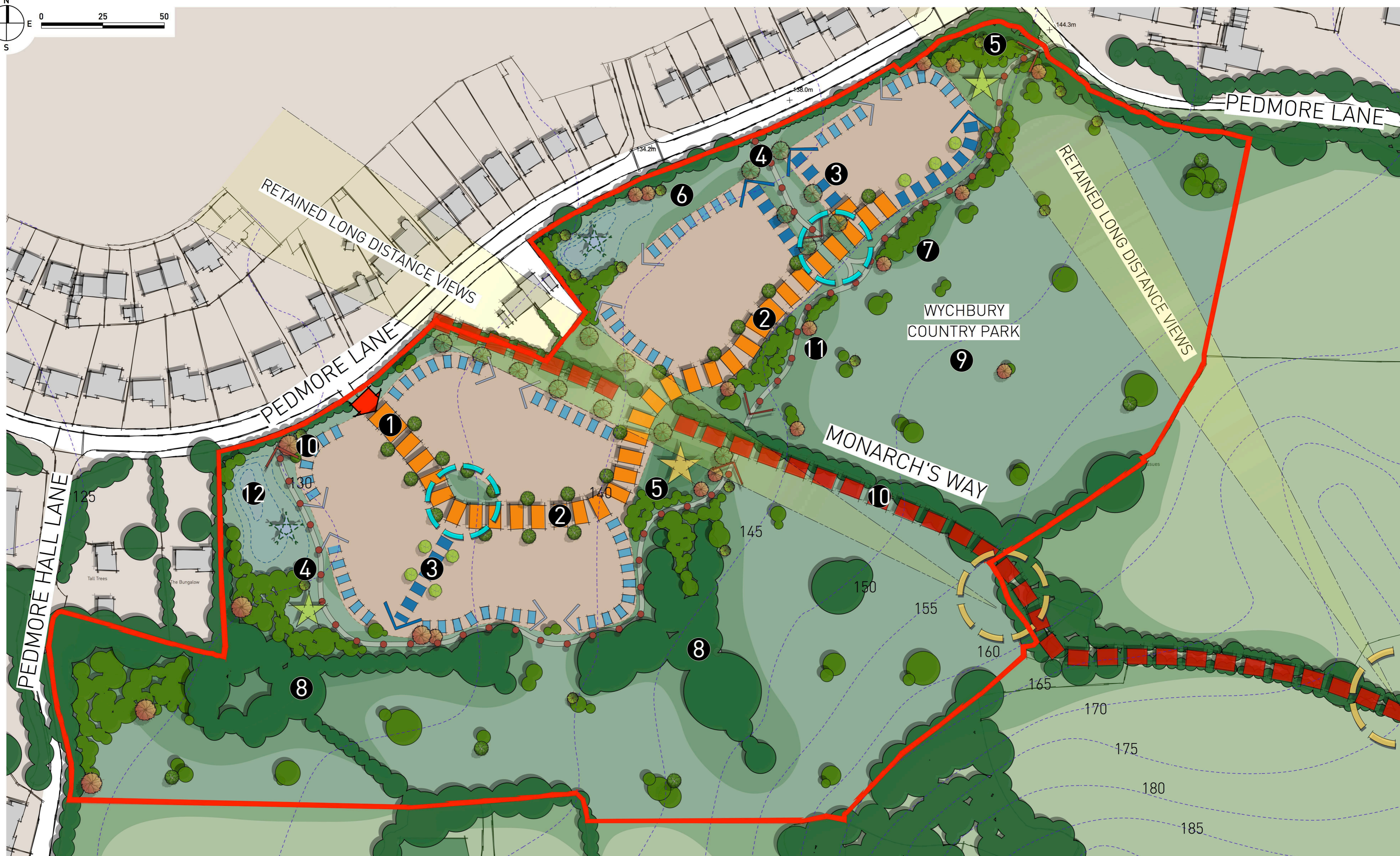
SITE A - 1/1000