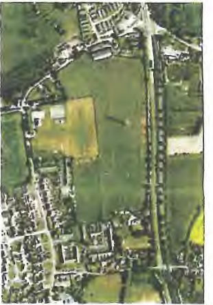
AERIAL OF SITE